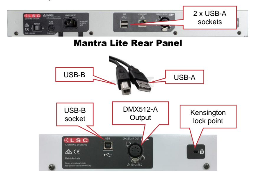
Mantra Wing Rear Panel

Mantra Wings are connected to the Mantra Lite console by a USB A-B cable (supplied). A maximum of 2 Mantra Wings can be connected to a Mantra Lite console.